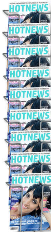
9 x A5