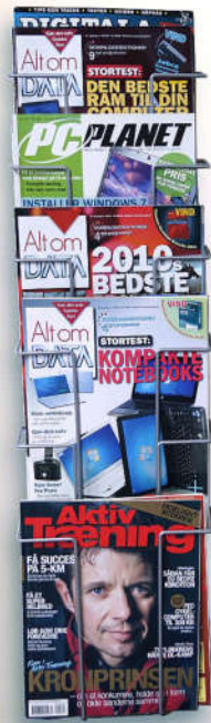
6 x A4