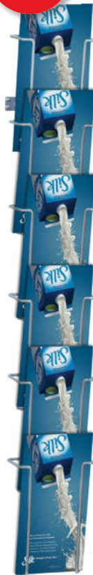
6 x M65