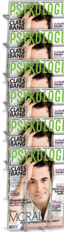
6 x A4