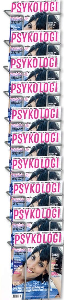
10 x A4